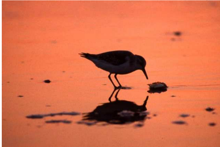
Sanderlings enjoy the solitude of the beach in winter

Yet there is much to be seen—visitors from higher latitudes share habitats with residents who are adapted for survival in conditions we regard as harsh. . Jeff Hall will present insight into the many strategies for making it through the winter, beautifully illustrated by striking photos.